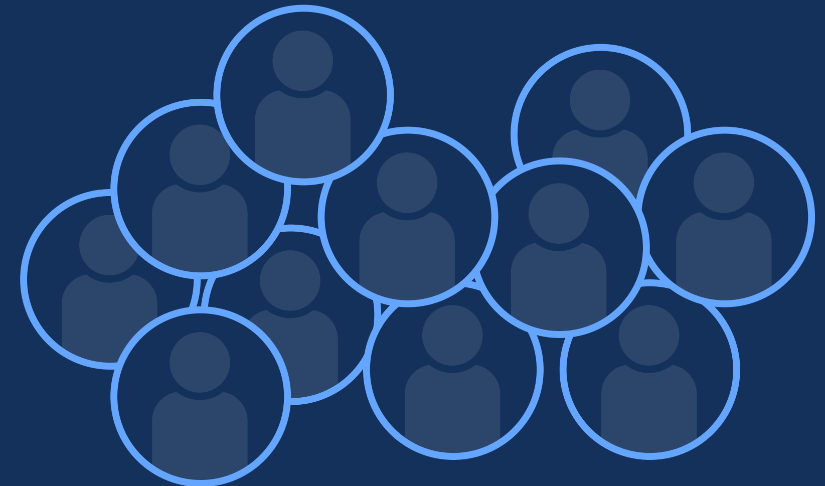
USERS (CUSTOMERS) ON heise.de

Intent data provides you with a list of target customers and allows you to customise your target account list optimise and keep up to date.