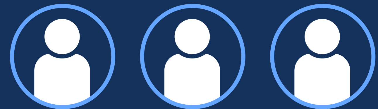
HIGH QUALITY CUSTOMER LIST